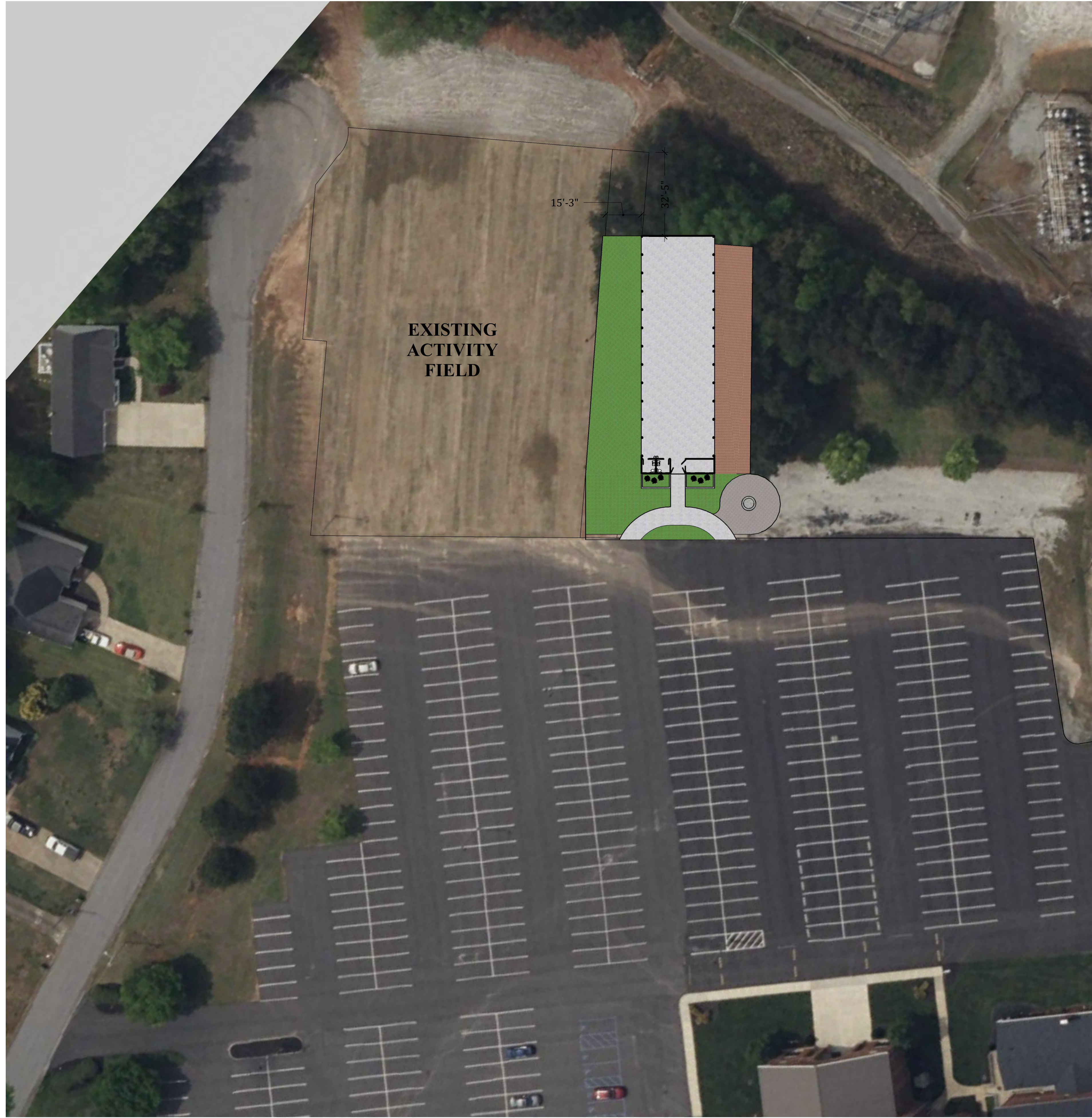
SITE PLAN SCALE: 1" = 30'